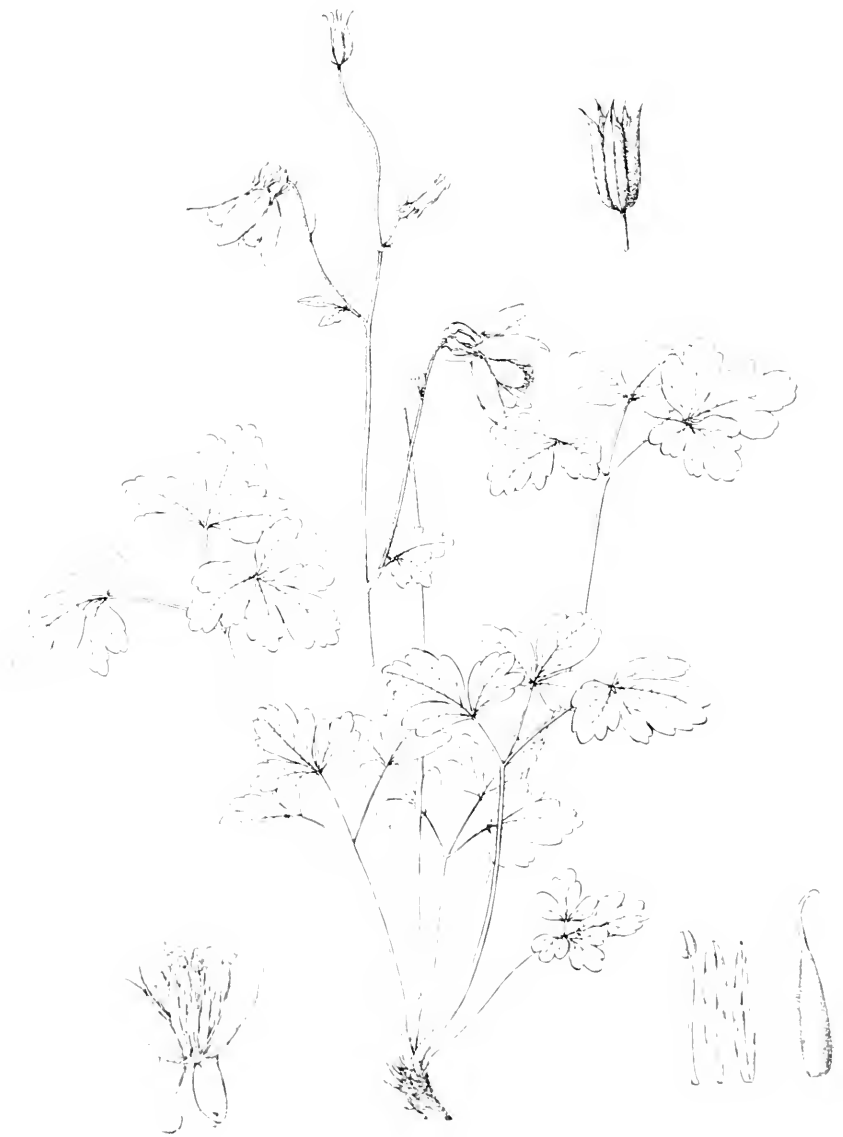
AQUILEGIA BREVISTYLA H. & A.